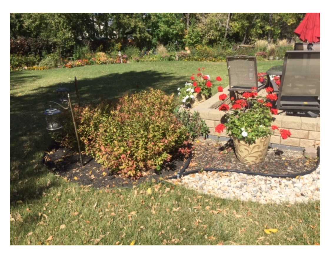
Our September meeting was held in this colourful setting.