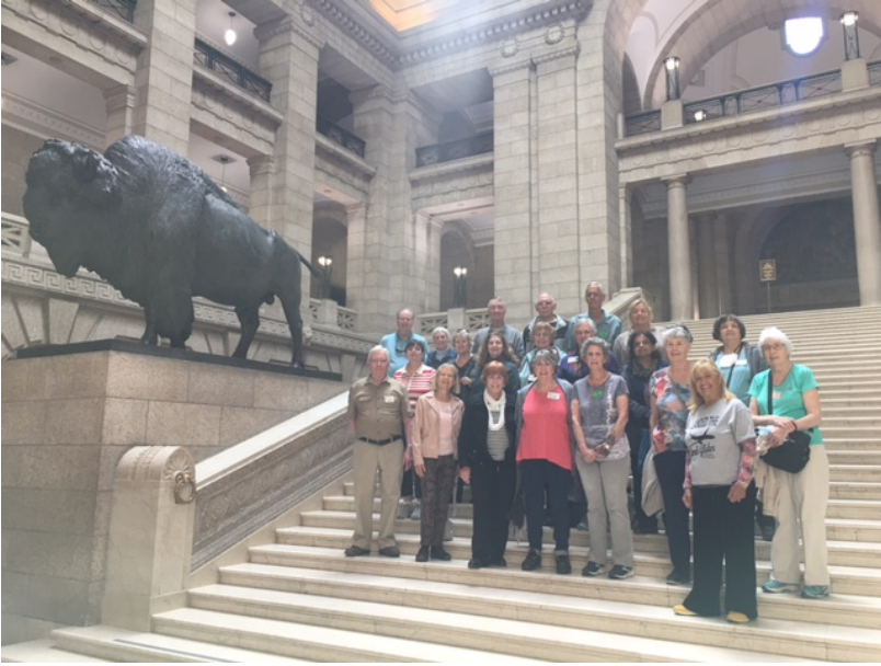
VISIT TO THE LEGISLATIVE BLG.