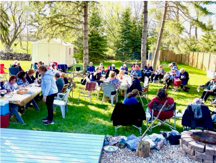
BBQ AT THE RYAN'S