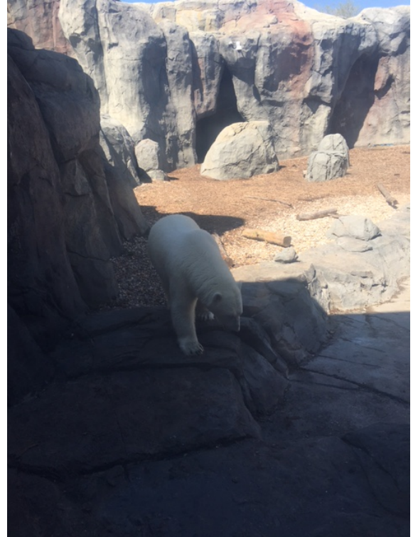
VISIT TO CHURCHILL