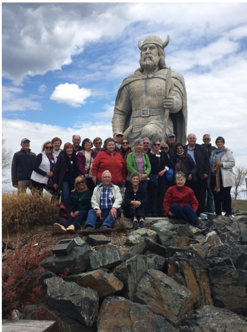
Meeting the Viking at Gimli - our first inbound Journey since the Covid shutdown.